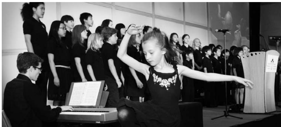
Members of Vancouver's University Community Children's Choir perform at the Opening Ceremonies Tuesday